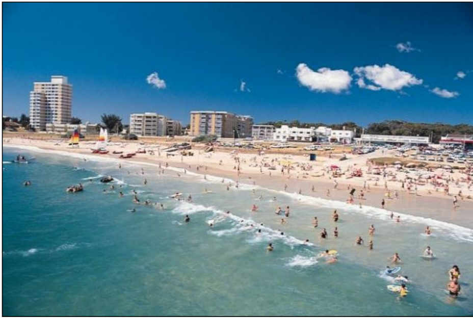
Port Elizabeth Beach